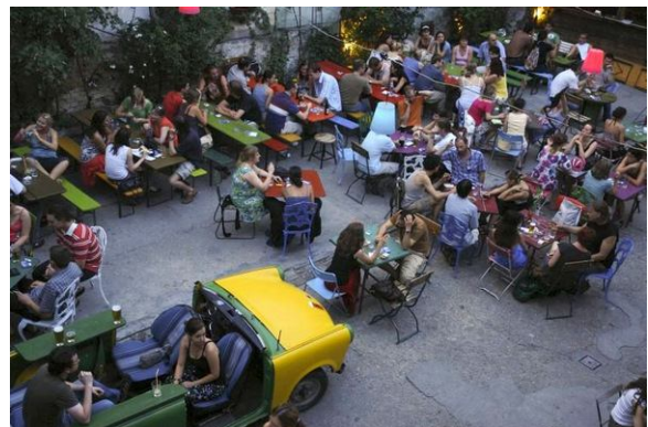
Szimpla Pub, fallmagazine.com

3. Szimpla Kert – one of the „ruin pubs”, which is unique and characteristic of Budapest. Address: Kazinczy u. 14, in a trendy pub-area close to M2 stop Astoria.